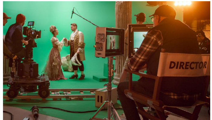
There's a fine line between loan-outs and productions

As stars are generally high-profile individuals, many standard carriers avoid writing personal liability exposures for them, as they tend to attract more liability suits than Joe Q. Public.