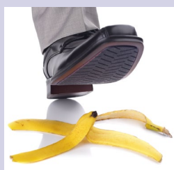
Slips and trips can happen anytime, to anyone

As an insurance broker, you are no longer acting in your capacity as an insurance broker when you leave your office. As a celebrity, if you are attending a production